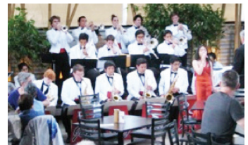
APRIL 11 Palm Springs High School JAZZ BAND