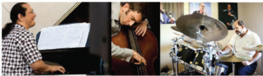
FEBRUARY 14 Jazz Trio CHARGED PARTICLES