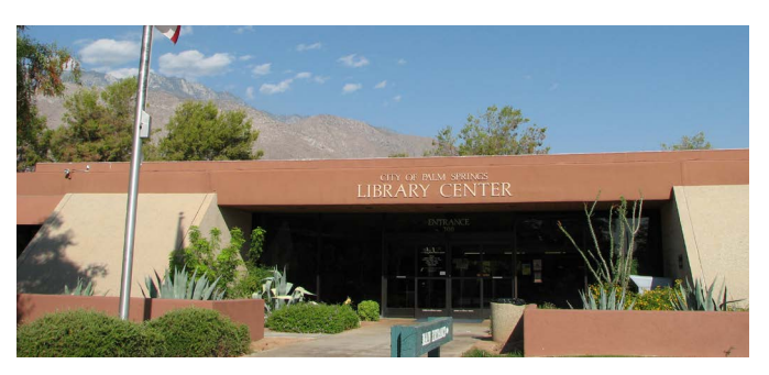
FRIENDS OF THE PALM SPRINGS LIBRARY

300 S. SUNRISE WAY • PALM SPRINGS, CA 92262-7699