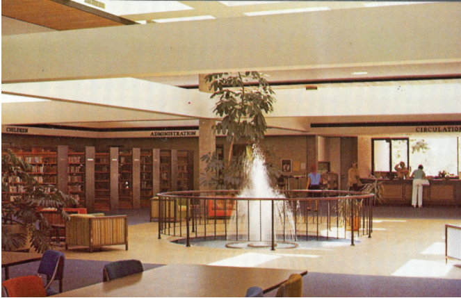
Above is a postcard showing the Library atrium when the building first opened.