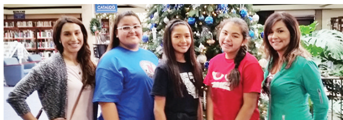
Helping the Friends set up chairs and serve refreshments were teen members of the Agua Caliente Youth Group.