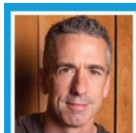
Dan Savage November 14