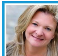
Lisa Scottoline March 26