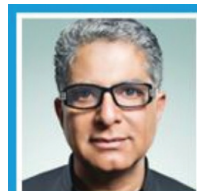
Deepak Chopra February 3